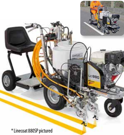
*Linecoat 880SP pictured