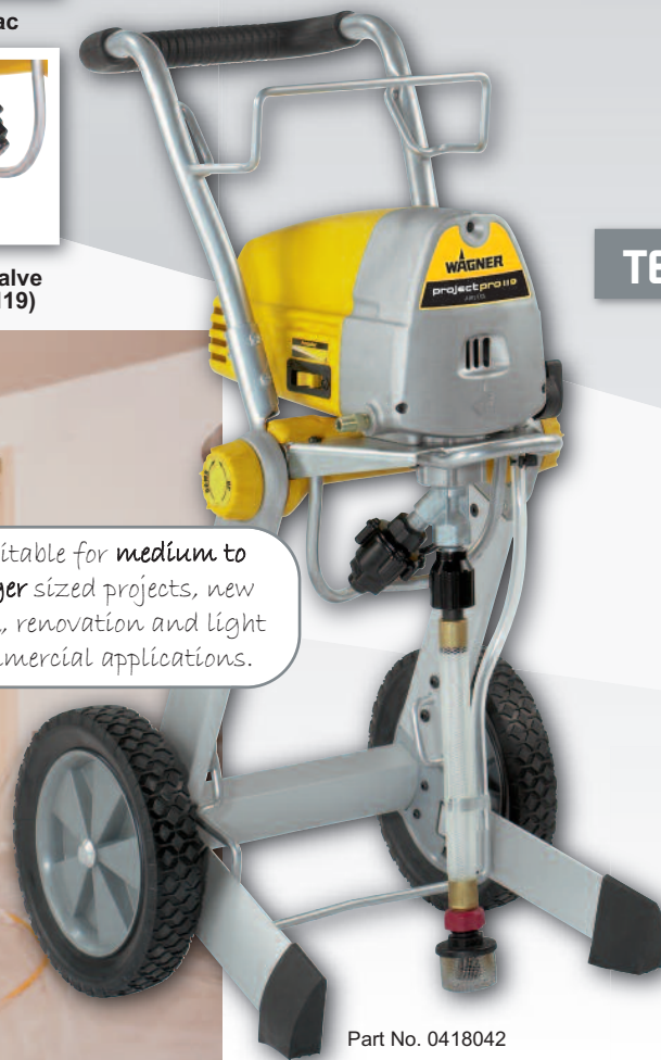
Part No. 0418042

Suitable for medium to larger sized projects, new work, renovation and light commercial applications.