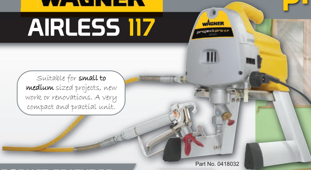
Part No. 0418032

Suitable for small to medium sized projects, new work or renovations. A very compact and practical unit.