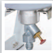
Manual valve depressor (117)