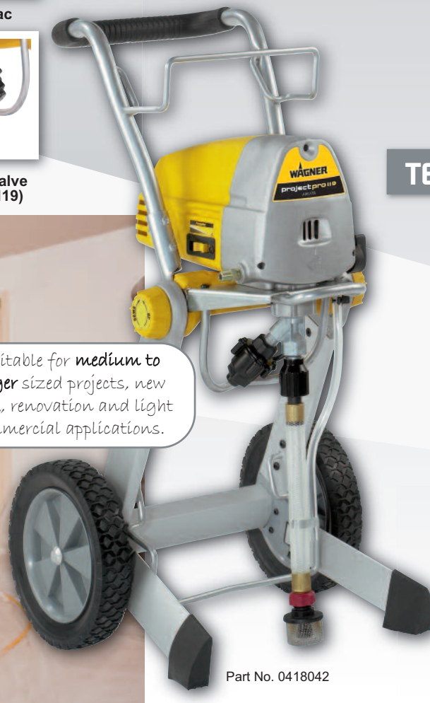
Part No. 0418042

Suitable for medium to larger sized projects, new work, renovation and light commercial applications.