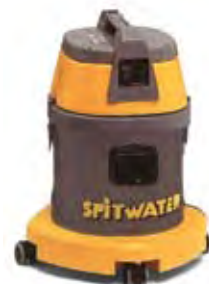
Part No. ASL10P

Chromed Steel Extension Tube, Bent Tube with air regulation, Crevice Tool, Furniture Brush, Round Brush, Floor Tool (Carpet), Flexible Hose.