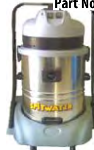
Part No. WD603S

32 mm Accessories, 2.5 Metres Suction Hose, Stainless Steel Extension Tube, Carpet Tool, Squeegee Tool, Round Brush, Crevice Tool.