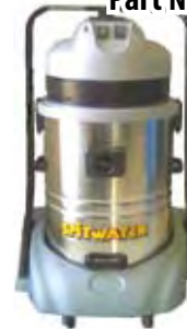
Part No. WD602S

32 mm Accessories, 2.5 Metres Suction Hose, Stainless Steel Extension Tube, Carpet Tool, Squeegee Tool, Round Brush, Crevice Tool.