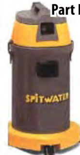
Part No. AS27P

2.5 Metres Suction Hose, Stainless Steel Extension Tube, Carpet Tool, Furniture Brush, Round Brush, Crevice Tool.