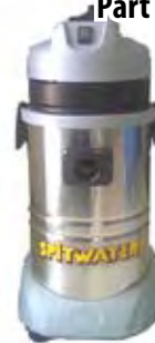
Part No. WD301S

32 mm Accessories, 2.5 Metres Suction Hose, Stainless Steel Extension Tube, Carpet Tool, Squeegee Tool, Round Brush, Crevice Tool.