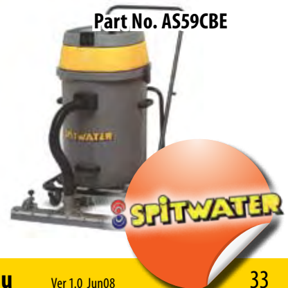
Part No. AS59CBE

Floor Brush & Squeegee Tool, Crevice Tool & Round Brush, 2.5 Metres Suction Hose.