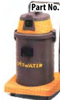
Part No. AS400MP

2.5 Metres Suction Hose, Stainless Steel Extension Tube, Carpet Tool, Furniture Brush, Round Brush, Crevice Tool.