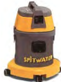
Part No. AS10P

2.5 Metres Suction Hose, Stainless Steel Extension Tube, Carpet Tool, Furniture Brush, Round Brush, Crevice Tool.