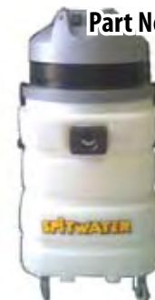
Part No. WD902P

32 mm Accessories, 2.5 Metres Suction Hose, Stainless Steel Extension Tube, Carpet Tool, Squeegee Tool, Round Brush, Crevice Tool.